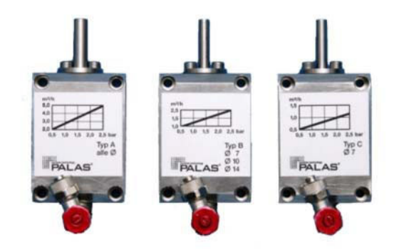
Fig. 3: Dispersing covers, type A,. type B and type C

Four different dispersing covers can be used for optimal dispersion (see Fig. 3, additional details under "Accessories").