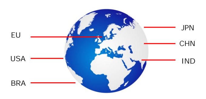
Figure 2 SR30 users are supported by the worldwide Hukseflux calibration and service organisation