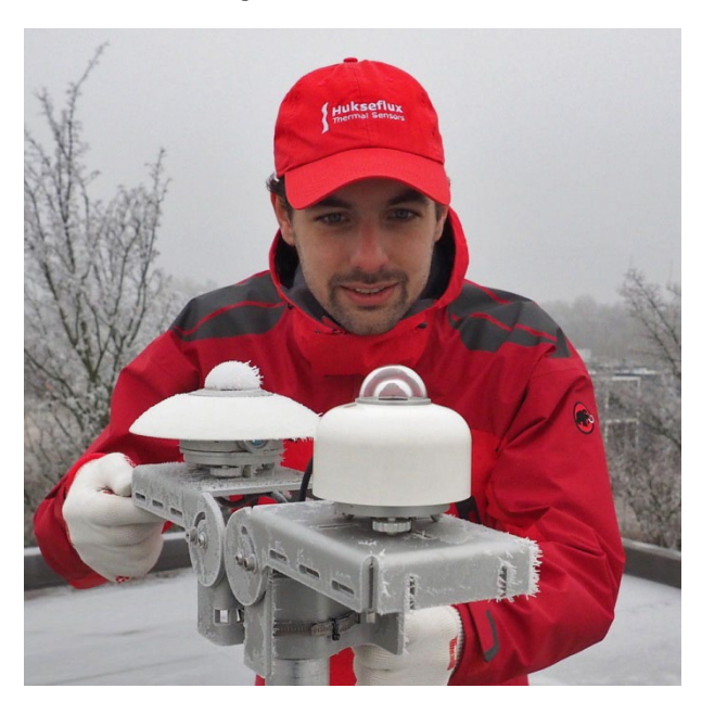
Figure 3 frost and dew deposition: clear difference between a non-heated pyranometer (back) and SR30 with RVH^{TM} technology (front)

The dome of SR30 pyranometer is heated by ventilating the area between the inner and outer dome. RVH ^{\text{TM}} is much more efficient than traditional ventilation, where most of the heat is carried away with the ventilation air. Recirculating ventilation is as effective in suppressing dew and frost deposition at 2 W as traditional ventilation is at 10 W. RVH ^{\text{TM}} technology also leads to a reduction of zero offsets.