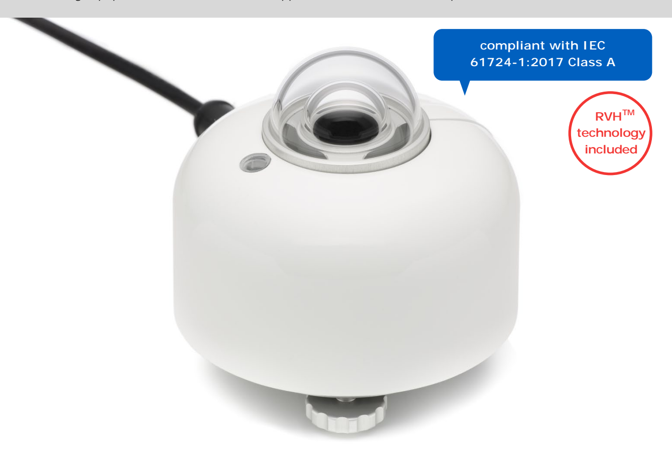
Figure 1 SR30 digital secondary standard pyranometer