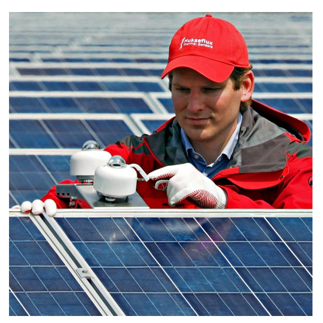
Figure 6 SR30 secondary standard pyranometers with digital output for GHI (global horizontal irradiance) and POA (plane of array) measurement applications