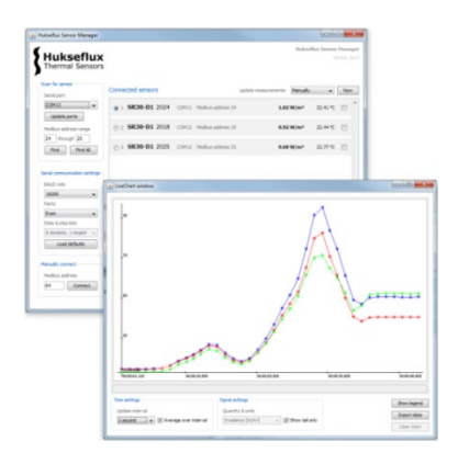
Figure 5 user interface of the Sensor Manager, showing sensor diagnostics

For communication between a PC and SR30, the Hukseflux Sensor Manager software is included. It allows the user to plot and export data, and change the SR30 Modbus address and communication settings. Also, the digital outputs may be viewed for sensor diagnostics.